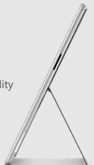
Lightweight and ultra-thin portability at 1.98lbs