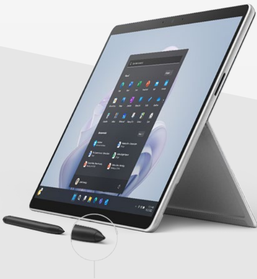
Surface Slim Pen 2 is always ready with wireless charging built into Surface Pro 9 Signature Keyboard

Security has never been more important; it's also never been easier with Surface Pro 9 and Microsoft SQ® 3. Pluton architecture secures sensitive data directly in the CPU, making it more difficult for attackers to access.