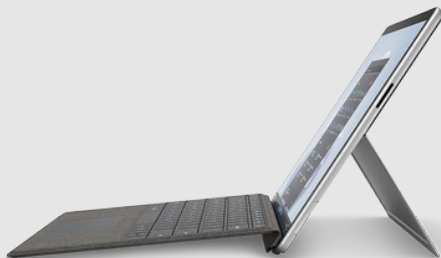
Adjust to the perfect angle with the built-in kickstand